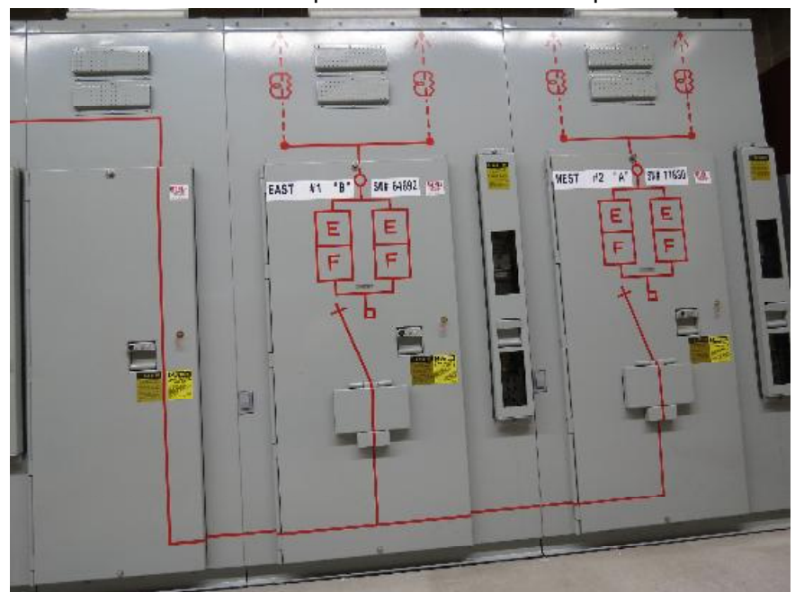
Figure 2: Bay 7 (center) and Bay 8 (right) of the Vault 24 switchgear lineup.