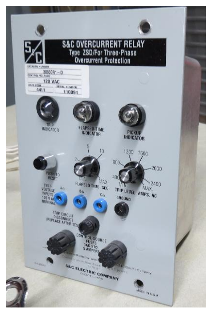
Figure 3: Photograph of subject relay from Bay 8 during bench testing after the outage.