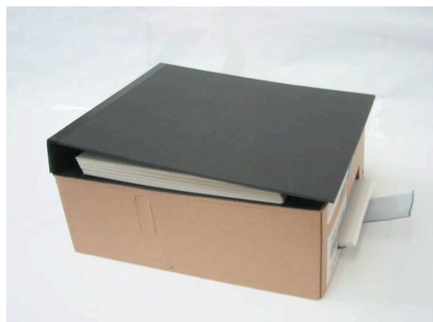
Figure 1. The ElderMail BUI provides tangible access to email using an “instruction book” as the user interface

This paper describes the design and preliminary evaluation of ElderMail. We begin with related work.