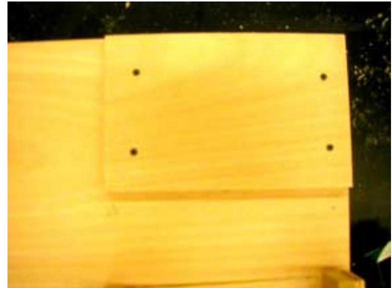
Figure 7. Base of box for drill mechanism.