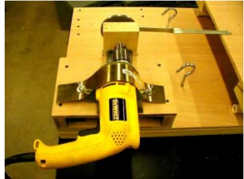
Figure 11. Similar view as Figure 10.