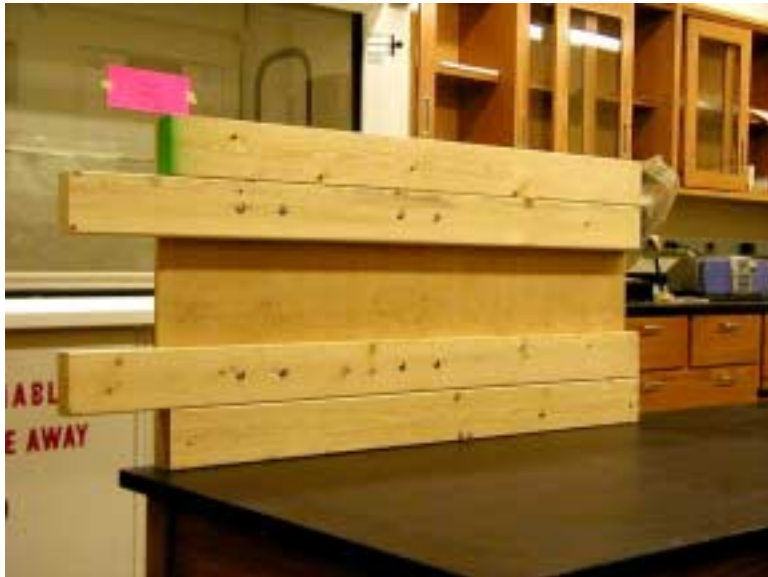
Figure 1. Underside of base showing locations of 2 x 4s.