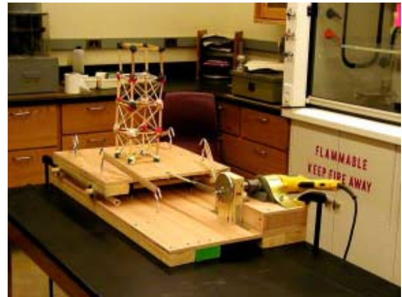
Figure 15. Assembled shake table with Popsicle stick building. Note c-clamp securing the table to the table upon which it rests.