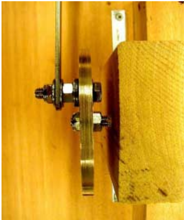
Figure 13. View looking down disk assembly.