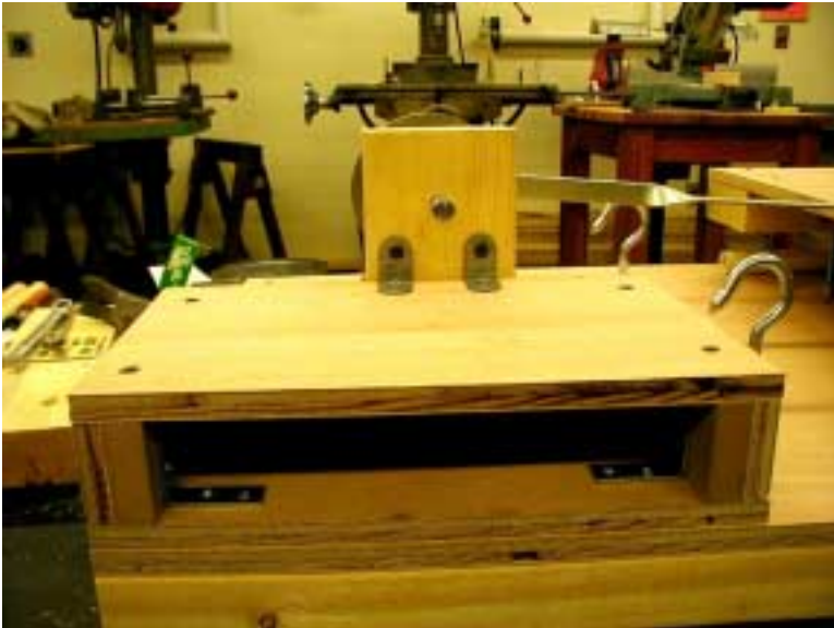
Figure 9. End on view of 6" 2 x 4 attached to box.