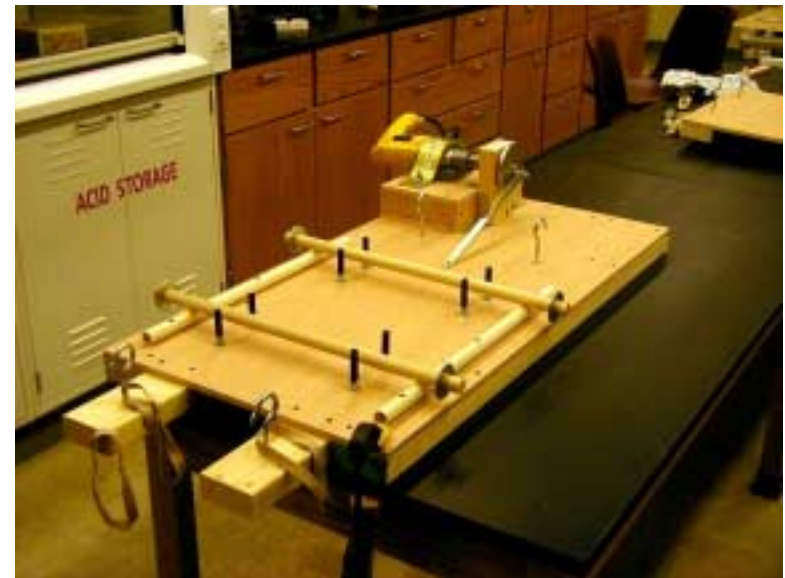
Figure 4. Top view of table showing locations of wooden dowels. Note washers attached to dowels.