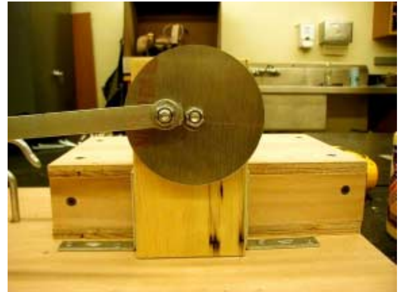
Figure 12. Close up of aluminum disk and armature.