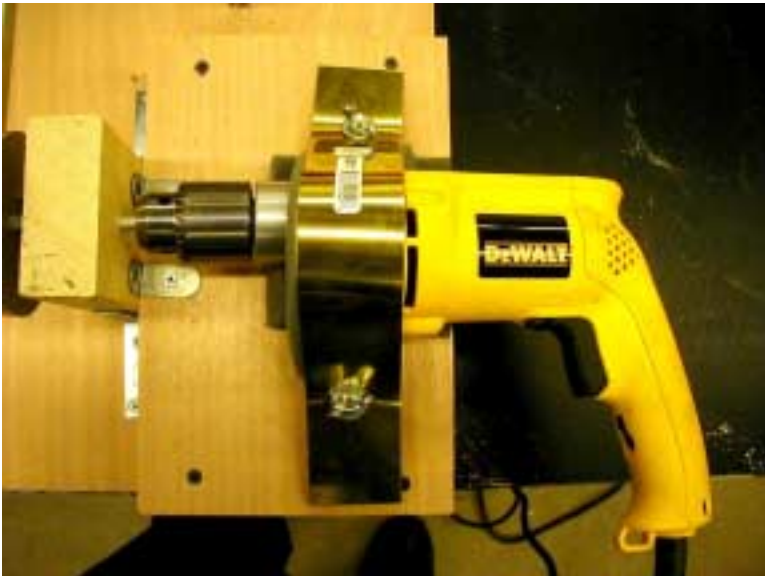
Figure 10. Strapping assembly for electrical drill.