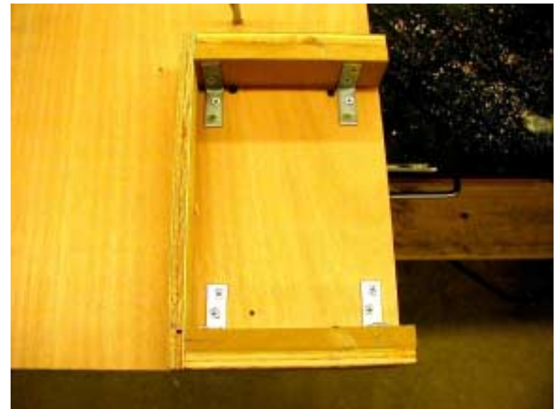
Figure 8. Box partially assembled showing corner brackets.