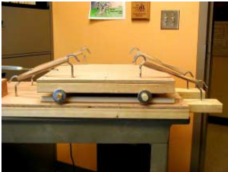
Figure 6. Shaking platform properly attached to the base.