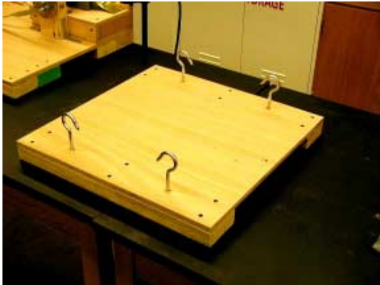
Figure 5. Assembled shaking platform with ceiling hooks attached.