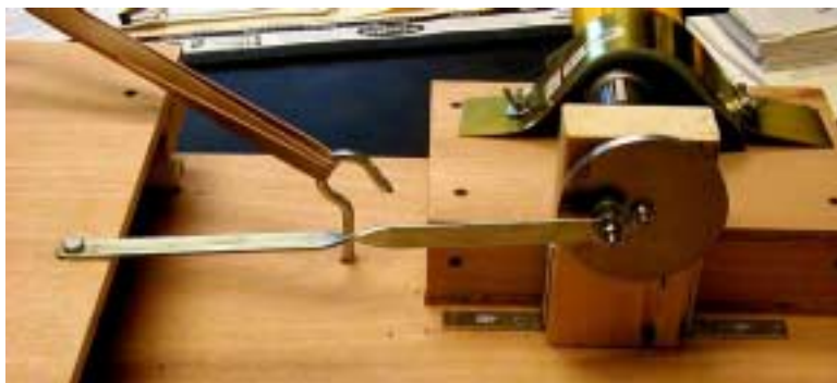
Figure 14. View of armature attached to shaking platform and aluminum disk. Note twist in armature for strength.