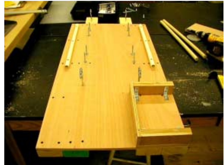
Figure 3. Top view of base showing positions of ceiling hooks. Partially complete box for drill also shown.