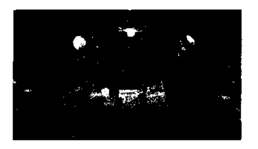
Fig. 4.3. Each character in this musical number from The Gypsies' Christmas Crawl 1 , made using the Star Wars Galaxies game, is controlled by a separate player.

To distribute all of this content, fans have created a range of online sites. Perhaps the most elaborate and best known of these is "The Mall of The Sims." Visitors can browse at more than fifty different shops that offer everything from the most up-to-date electronics to vintage antiques, from medieval tapestries to clothes for hard-to-fit sizes—and skins that look like Britney Spears or Sarah Michelle Gellar or, for that matter, characters from Star Wars. The Mall has its own newspaper and television service. At present, the Mall boasts more than 10,000 subscribers. Wright notes that the success of the franchise just about led to the extinction of the fan