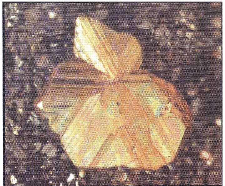
Friend or foe? A beautiful 0.3 cm cubanite (copper iron "sulfide") crystal from Marquette County, Michigan—locus of both an emerging nickel copper exploration and mining industry, and an emerging anti-sulfide-mining "pop environmentalism" industry.

The model that has developed in the Northwoods is a far cry from genuine environmental protection. What happens is that a mineral company sets up shop and starts exploring. Local residents welcome their presence and the money that explorers spend in their community. All is well until the company develops an advanced project that could be brought to the mining stage. Wealthy, nationally-recognized, "big environmental" groups take note and start to draw local attention to the possible new mine by spreading false information to the general public. "Big environmentalism" knows that like religious affiliation, most people do not change their views on mining once they have been made; so by engaging in disinformation blitz campaigns heavy and early, "big environmentalism" guarantees a stable, local base of anti-mining activists.